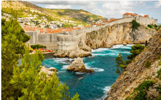
The Walls of Dubrovnik

The law is increasingly starting to grapple with these issues. Local governments are exploring ways to moderate its impacts with regulations such as limits on short term rentals, while land managers try tools such as permit-based access restrictions. Such efforts are both challenging and controversial, and require balancing between property rights and community benefits, resource protection and visitor access. Easy answers are few and far between, requiring leaders and attorneys with creativity and analytical skills. Those are of course exactly the sorts of graduates our program produces, and I'm looking forward to soon putting together a module on tourism and its impacts for our online LLM Emerging Topics class.